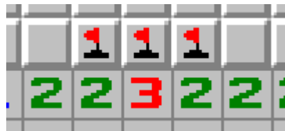
The ‘3 on a wall’ pattern

Sooner or later people using this tactic most likely will change step by step to the method with which all advanced and professional Minesweepers solve their boards: pattern recognition. Starting with easy patterns (3-on-a-wall), that save a few seconds thinking time, advanced sweepers are usually able to immediately recognize the mines in more and more difficult patterns, while the top sweepers even have the time to think about where they most likely will have to click after their current clicks.